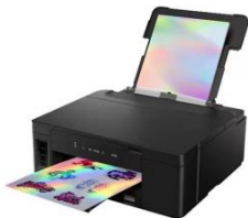
Ink jet printer